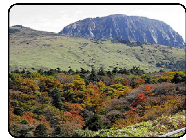
The famous Mount Hallasan

So it's time to start practicing with chopsticks, if you aren't already adept! And be prepared to eat some of the healthiest and best cuisine in the world. Add a few days to see the island, hike the lava tubes, or see the caves. For more details about Jeju Island, a popular Asian destination, please see our May newsletter issue.