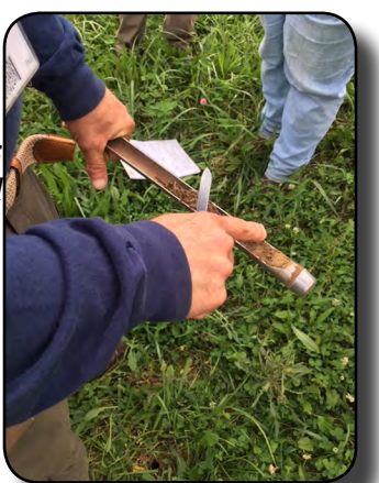
Tony explains inherent soil properties.

• I like the shorter format concept (1 day) that was proposed as a post-course option