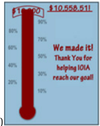
IOIA tracked the progress of the drive on the website home page with this "thermometer".

IOIA's Fundraising Drive broke all previous records! For the first time ever, IOIA participated in a campaign for "Giving Tuesday" – the first Tuesday in December. Fundraising and increased levels of support at the higher membership categories – patrons, sustainers, and supporting certification agencies - was a significant goal attained. The drive brought in more than $10,000 - some of that through new Patron members. In 2014, IOIA gained four Patron members (Driscoll Strawberry Associates, Hidden Villa Ranch, MOM's Organic Market, and Aurora Organic Dairy) and one of those (Driscoll's) stepped up to Sustainer in early 2015. The most ambitious fundraiser was a "Join the IOIA Team" event in Anaheim, California in March in conjunction with Expo West. Over 20 people attended, and it was a major contributor to the success of the patron/sustainer member drive. Kelly Shea of WhiteWave Foods was a key participant in the fundraising committee's work, the Anaheim