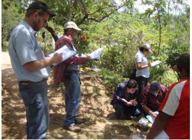
Mock Inspection at ASOPROL

Field trip took place at Yerba Buena mountain area with the Asociación de Productores Orgánicos de Lepaterique - ASOPROL - where friendly growers welcomed us and allowed students to "fire at will" dozens of questions about their organic horticultural crops grown. This project started in 2005 as an effort to reduce agrochemical use through conversion to