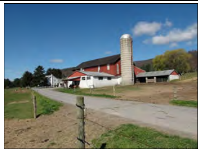
This Amish Farm in Central Pennsylvania was host to the IOIA/PCO Livestock Inspection Course

Pennsylvania was the host state and boasts a long history of organic agriculture. Eastern Pennsylvania is the home to one of the largest organic research farms in the United States, the Rodale Institute. With 60 years of sustainable