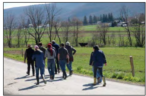
"This field trip was really helpful because it did feel like an inspection, not a contrived exercise."

The week kicked off with a headfirst dive into the - "Pasture Practice Standard" (§205.240 for those who are still getting used to it). With discussion swirling around the impact the rule will and has had on producers and inspectors, it was the most talked about citation in the standards. Also as those in the organic world have heard, the United States and the European Union recently reached a new organic standards equivalency agreement. This development led to much discussion about the inspectors' roles for gathering information on US products bound for foreign markets. Recently revised interpretations of biodiversity on the certified organic farm were also discussed in detail.