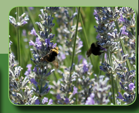
_aunched another member initiated 300-level webinar – Inspecting Bee Keeping Operations.