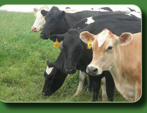
Updated and delivered the 200-level livestock feed audit webinar