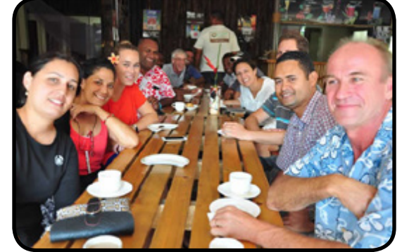
Fiji attendees relax at the end of a long day.

The participants were terrific. After hours we ate and talked and drank kava, made a fire on the beach and sung songs of home for each other. I have answers to questions about farming that it never