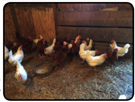
Layers on Rosmann Farm produce eggs for the on-farm store and a farm-to-table restaurant in town.

After a warm lunch at the family's restaurant Milk & Honey, the group debriefed back at the hotel using flip charts. Finally, they took on the task of writing the inspection report before the test next morning.