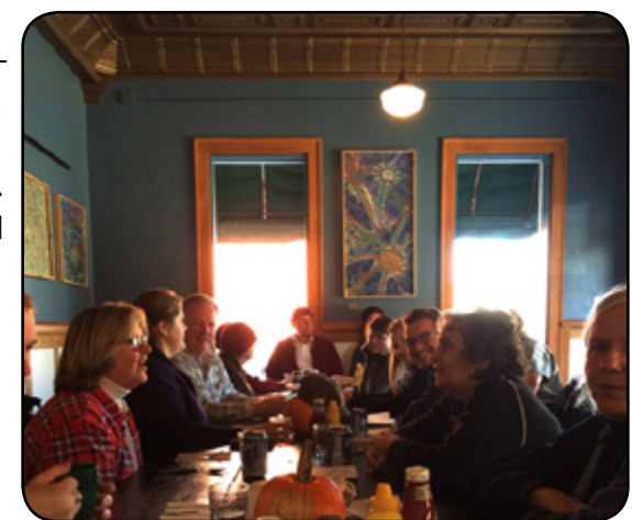
The group enjoyed coming in out of the cold & mud to a delightful hot lunch at Milk & Honey, the family's restaurant. Meats and eggs come from the family farm.