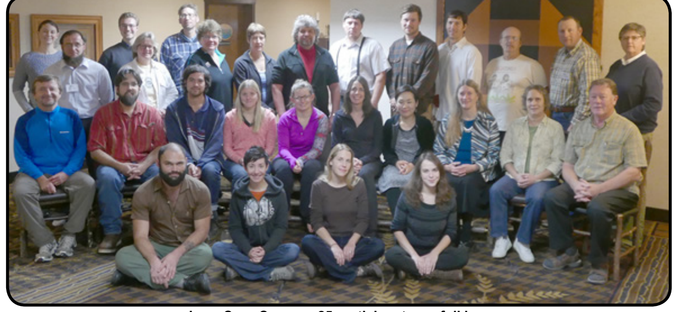
lowa Crop Course - 25 participants - a full house.

The Inspectors' Report -16- V24 N4 V24 N4 -17- The Inspectors' Report