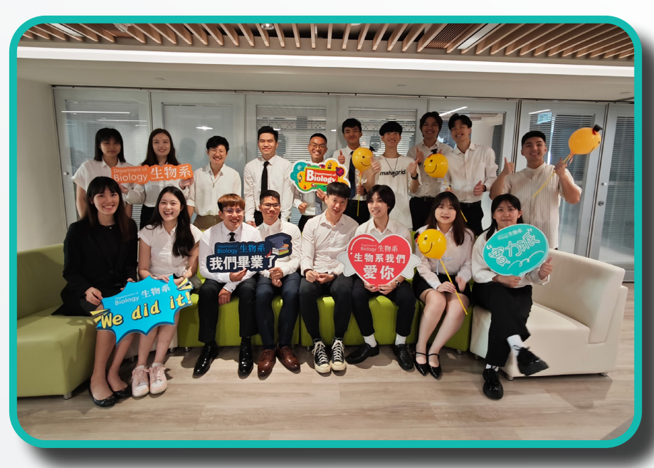
Basic Crop Inspection training at Hong Kong Baptist University

Trying something new with ACA, IOIA hosted a small group of staff from certification agencies during the first two days of the basic processing training in Minnesota. Agency staff, primarily reviewers, joined the prospective inspectors for labeling; permitted processing input materials; sanitation and