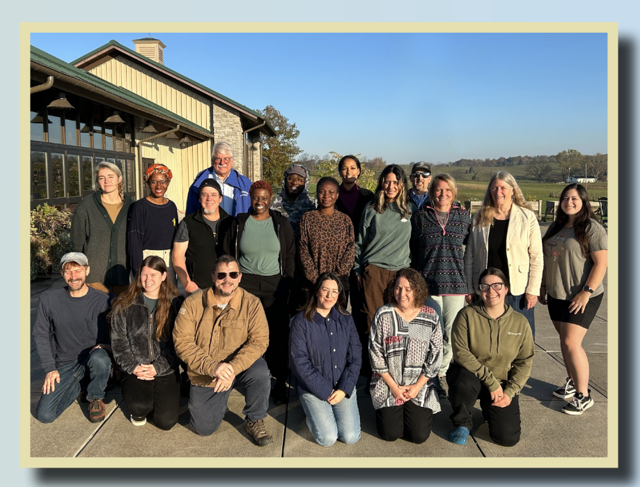
Kentucky Basic Crop Inspection Training

"IOIA is committed to advancing equity principles within organic agriculture, especially for those who work as organic inspectors. We believe that a robust community of inspectors thrives when it embraces the diversity of the producers and processors we serve from coast to coast in North America, and around the globe. By fostering an inclusive environment, we ensure that differing voices and perspectives are heard, to support the optimal development and delivery of inspection training. We are dedicated to equitable access to resources, education, and opportunities for all those who pursue a career in inspection, particularly those from historically marginalised groups. We believe that the ethnic and gender demographic of organic producers and processors (and those in transition) should ideally be reflected in the pool of active inspectors.