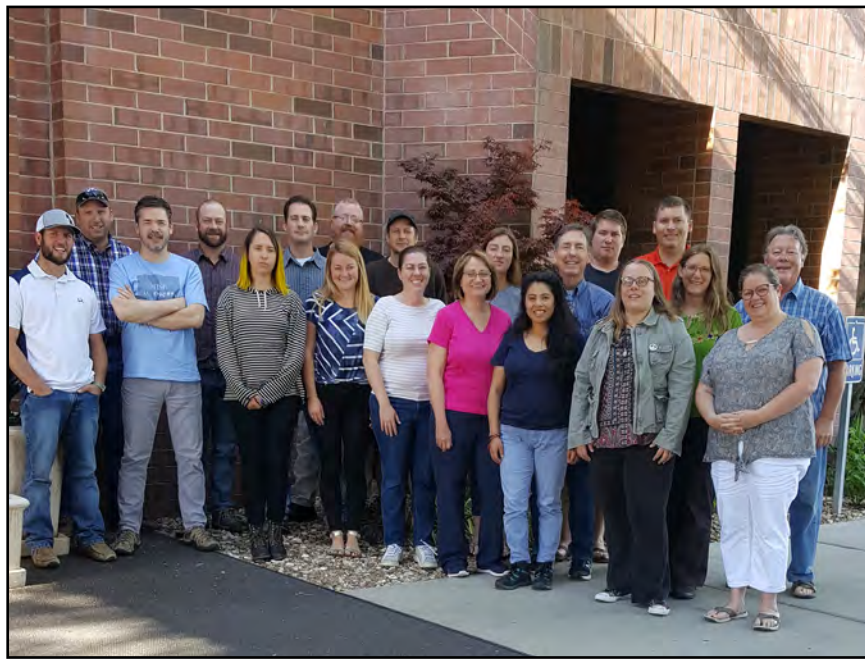
IOIA/UDAF Processing Course participants

Central Milling hosted all three processing field trips – each at a different site.