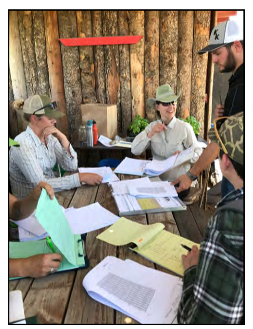
Deep in audit trail – and the host is still smiling – the group was doing great! The Utah State University student farm hosted this crop inspection training field trip.

UDAF was cosponsor extraordinaire – arranging all field trip logistics including providing transport and drivers for all groups. UDAF has cosponsored several training with IOIA, dating back to 2001, but all previous trainings were delivered in-house. This was the first open-enrollment course.