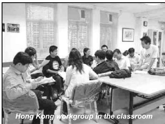
Hong Kong workgroup in the classroom