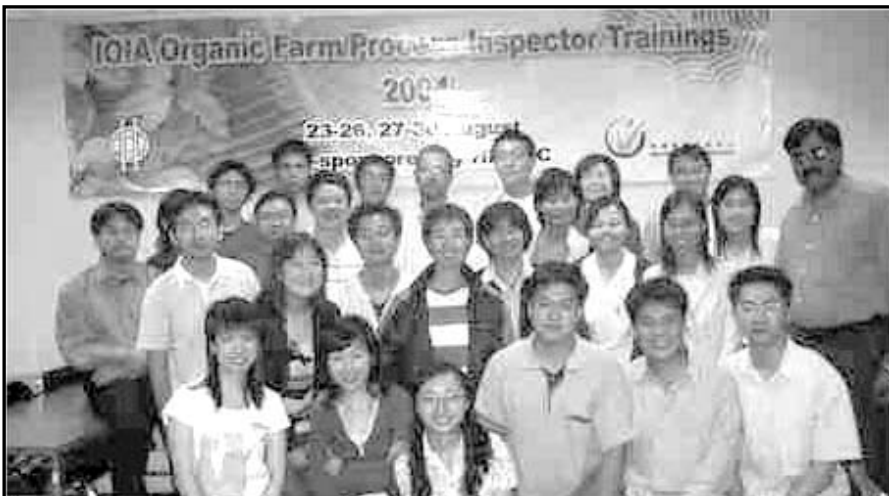
Nothing Outrageous in Hong Kong (except, perhaps, for Costa Ricans and Indians learning to eat using chopsticks!)

Farm field trips were organized with the cooperation of the Agriculture, Forestry and Conservation Department (AFCD), that has launched a project to promote organic agriculture among farmers, provide technical assistance and internal control system. The processing field trip was supported by the Vegetables and Marketing Organization, an innovative organization that markets organic products in Hong Kong and also hosted the field trip to its fresh vegetables packing line.