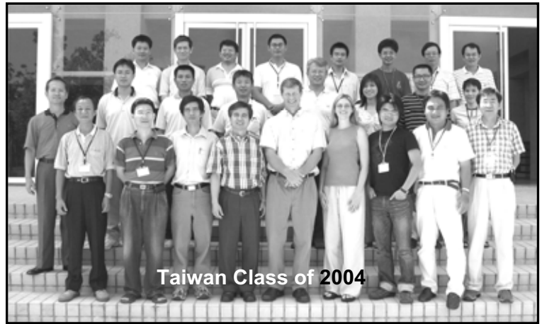
Taiwan Class of 2004

Hopefully future courses will not be scheduled during typhoon season!