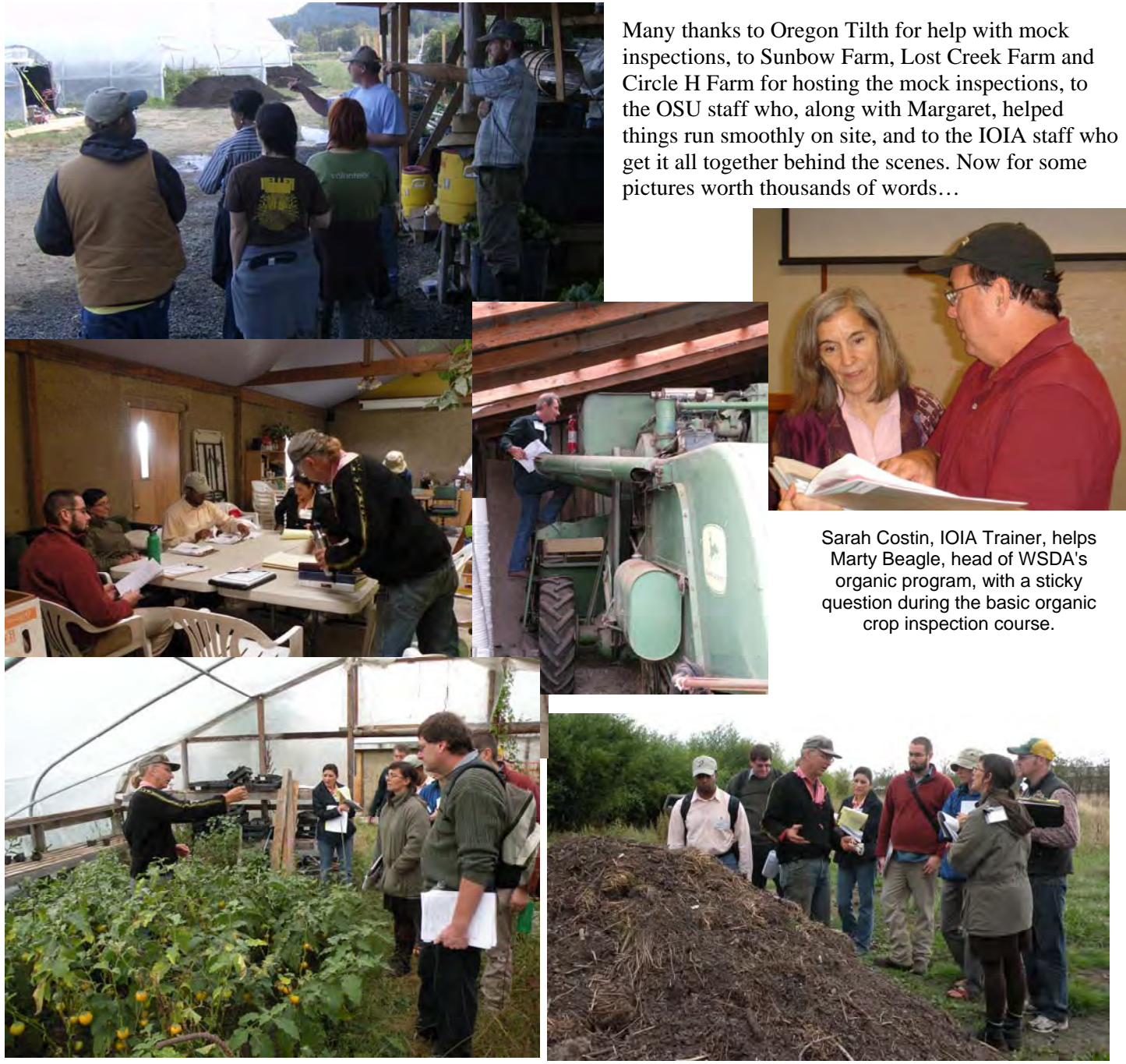
THE INSPECTORS' REPORT/FALL 2010/PAGE 12

energetic presentations, and humor- and provided valuable "tutoring" outside of class for anyone who asked.