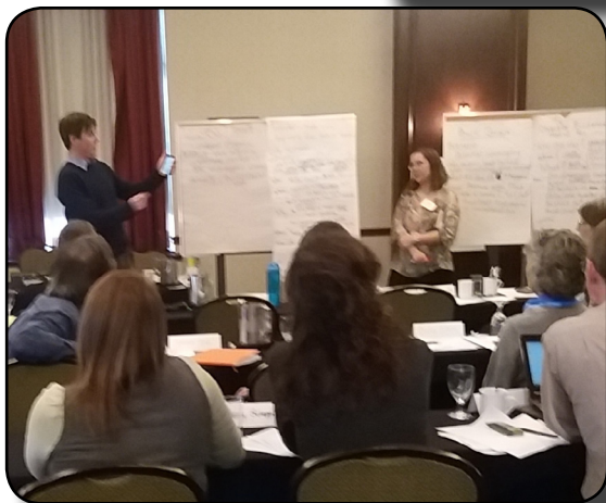
Left: Participants split into subgroups to study scenarios and then made presentations of their findings to the full group.