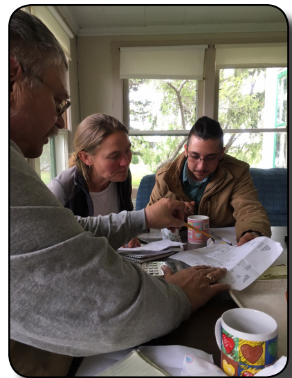
Audit Trail - Livestock course participants try their hands at trace-back and in/out balance.