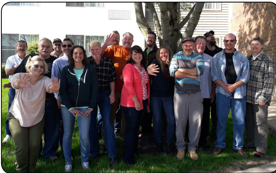
Day 5 at the IOIA Basic Livestock Inspection training in Iowa, and all is well! As noted "This was a great group to work with, everyone was so supportive, really appreciated the trainers (Garry Lean and Jonda Crosby) capacity to keep us on track and also to push us to learn as much as possible all week long.