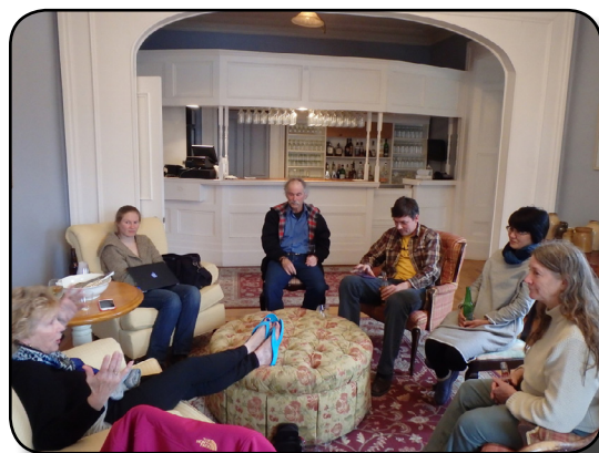
Board Governance - not a job to take sitting down!

Question is IOIA copyright status for the materials which is the benefit of funding the writing. Kathe Purvis proposed an MOU with the Asia Pacific Committee. Board approved the use of existing funds allocated in the Training Institute and Asia Pacific Committee ($3000) for the creation of training materials.