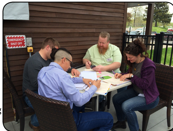
Small group practices doing a trace-back and in/out balance for an apple orchard.