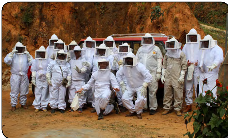
"Normally it's paper suits and hair nets."

Mexico was a fitting location for IOIA's most comprehensive apiculture training ever, as it produces much of the world's organic honey.