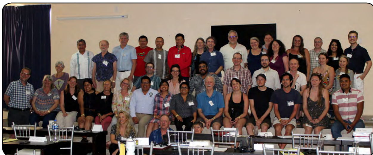
Overheard at a refreshment break – “This was the best IOIA training I’ve ever attended...”