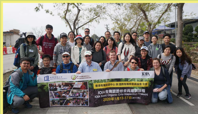
Above: Training in Hong Kong, January 2020