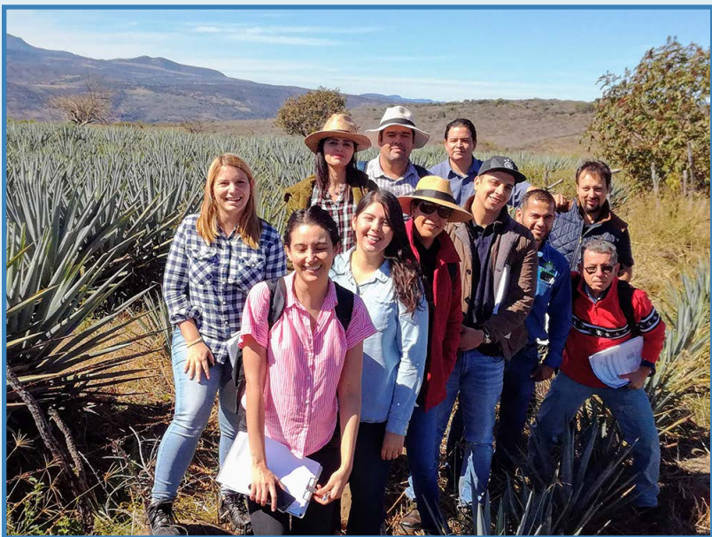
Basic Crop Inspection Training - Mexico

Thailand; Hong Kong, China; USA; Mexico; Japan