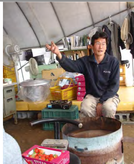
A Korean organic strawberry farmer at the Paldang Cooperative explains his dire situation. His greenhouse will probably fall to construction equipment within the year, unless the activists and farmers are successful with their protests.

In an important breakthrough, scientists in Europe have discovered a major new, widespread exposure pathway through which bees are ingesting nicotinyl insecticides in