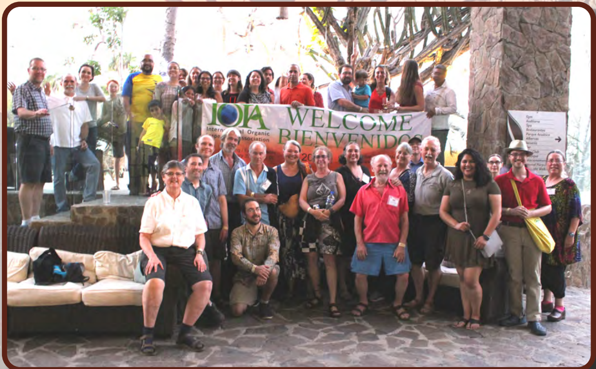
2019 ANNUAL MEETING, HUATULCO, OAXACA, MÉXICO