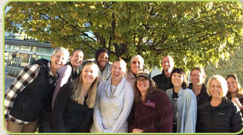
IOIA members enjoy a special camaraderie, which often begins with their first IOIA training experience.