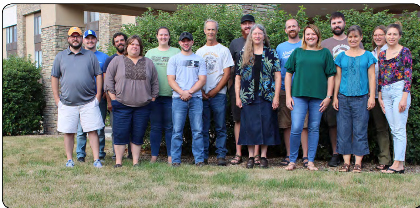
Iowa Crop Group, August 2019

One of the groups walked through fields of corn and hay, evaluated the risk on buffers with organic farms, a small cemetery, and the county road. They established rapport with the grower. It was a beautiful day, overcast to stave off the sun. Perfect weather in fact - totally not what would usually be expected in mid-August in the humid Midwest. The participants stopped to admire the soybean field. One asked the farmer how he got them so clean of weeds. When he answered “Roundup”, jaws dropped until they saw the twinkle in his eye. He followed up, with, “We rounded up the grandkids and the neighbor kids, and we pulled them...!”