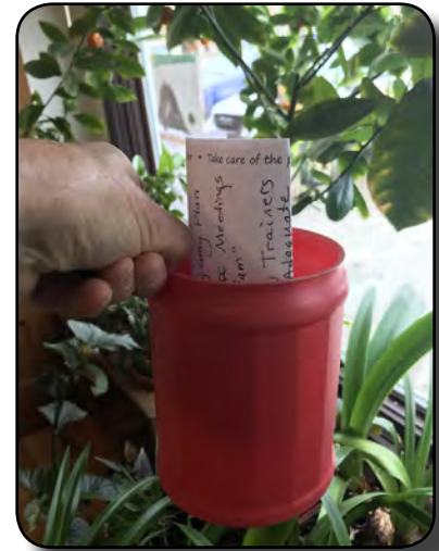
IOIA Imperatives in a Watering Can.