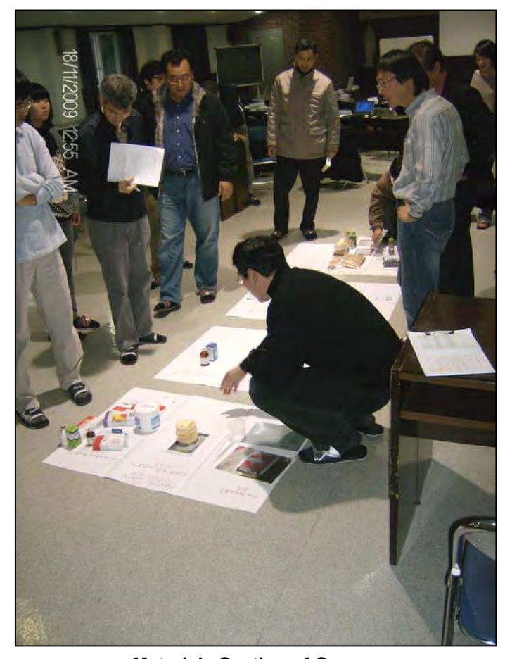
Materials Section of Course

The IOIA/KFSAO training was held at Isidore Farm on Jeju Island. Jeju Island is an island south of the Korean mainland famous as a destination for honeymooners and the first IOIA training in Korea. Think subtropical, think mandarin oranges, think palm trees. Or at least that is what I was thinking, being a Canadian and it being November. Day two of the training I woke up to a sprinkling of snow. Apparently, given the vulgarities of elevation, mandarin oranges and snow can co-exist on the same island.