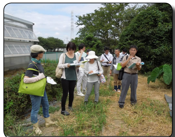
Basic trainings all begin with instruction in the standards, followed by classroom preparation for the practicum. Small groups conduct mock inspections of organic operations and write a report.