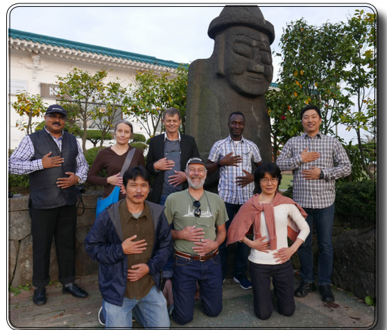
India, USA, Australia, Ghana, Korea, Thailand, USA, Japan - New friends, old friends, meeting in Jeju.