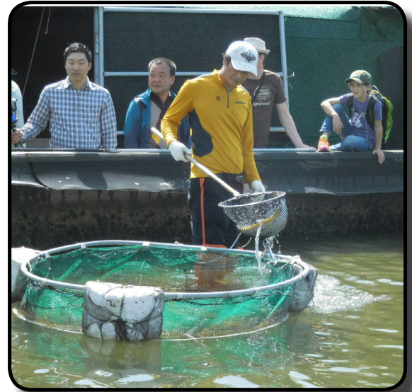
Twice in 2016 - Organic Aquaculture workshops