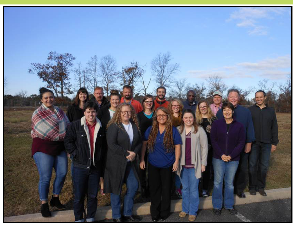
Republic of Korea December 4 - 8

This member-initiated webinar. was delivered by Silke Fuchshofen on Nov. 28 and Dec. 14. What did participants have to say afterwards? "The drawings of the different departments and how they communicate or don't communicate with each other were excellent!";"The examples of different systems to verify the last certified entity that could all result in compliance were also really helpful."; and "The example interview questions to uncover what procedures exist / truth whether they are actually followed are great." IOIA will continue to offer this webinar as open-enrollment and will offer it to certifiers as an in-house option.